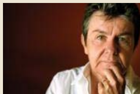
Kay Ryan will be giving the keynote speech for the Vegas Valley Book Festival.